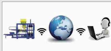
On-line technical assistance