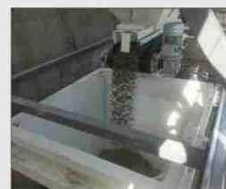
Hopper by weight